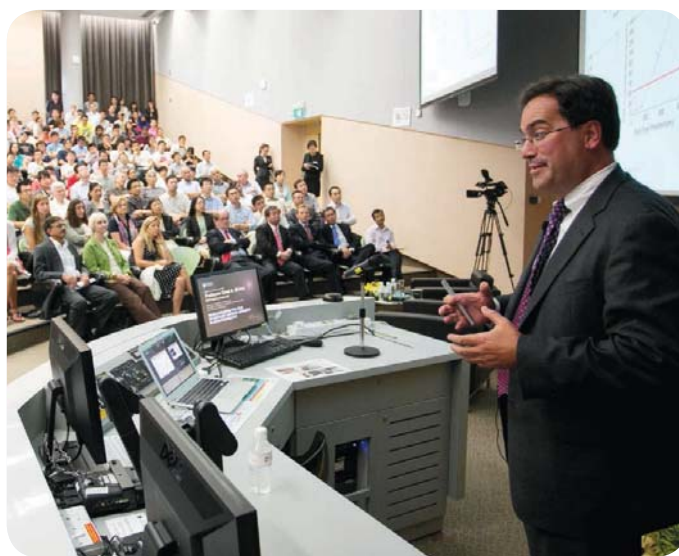
New directions. Chad Mirkin, shown here giving a lecture in Singapore, says his satellite lab allows him to expand the types of research he's able to pursue.

The Vietnam center, for example, specializes in making novel porous materials. Its long-term goal is to find applications in the energy sector, such as storing hydrogen and other energy-rich gases, as well as environmental applications, such as designing novel water-filtration systems. In Japan, members of Yaghi's lab are searching for novel met-